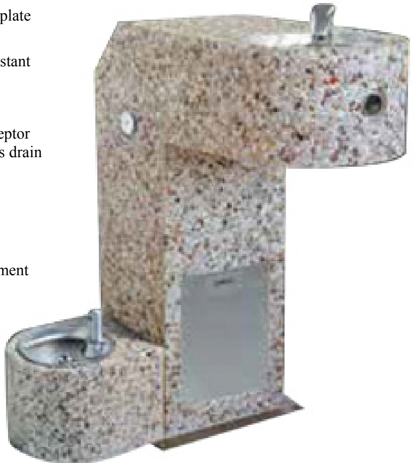
(Shown above) Model APF-3500-C-94