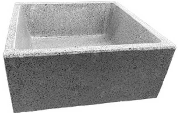
(Shown above) SB-400

Tiling flanges are optional, made of stainless steel, and extend 1" above the shoulder on 1, 2, or 3 sides, as required.