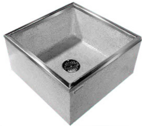
(Shown above) SB-900

Tiling flanges are optional, made of stainless steel, and extend 1" above the shoulder on 1, 2, or 3 sides, as required.