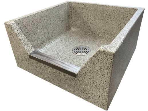
(Shown above) HL-1800

Stainless steel caps on all horizontal shoulders and tiling flange may be added to customize any sink to meet your specifications.