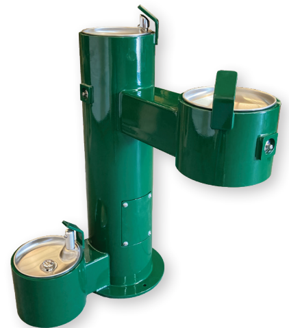
5700-90 Dual Drinking Fountains & Pet Fountain

*See sternwilliams.com/connect for local representation