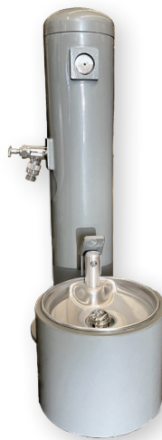
9000-66-SS-32-LK Hose Bibb Hose Rack & Leash Hook