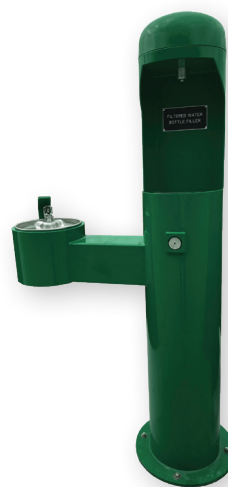
7700 Bottle Filler and Fountain