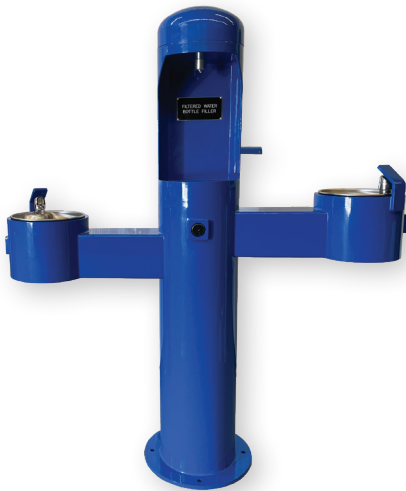
7925 Dual Fountain Bottle Filler