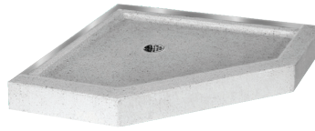
43 Neo Corner

Square Models: 50 - 66 Rectangular Models: 82 - 94.5 Neo Corner Models: 42 - 46 2" Centered Brass Drain All Sides Include Tiling Flange Except at Threshold