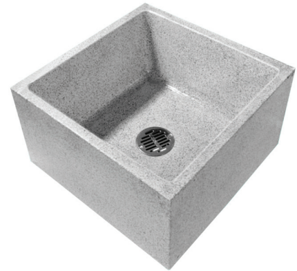
(Shown above) SB-400

Tiling flange is across back and on left side on model numbers ending in "L" or across back and on right side on model numbers ending in "R". Tiling flanges are optional, made of stainless steel, and extend 1" above the shoulder on 1, 2, or 3 sides, as required.