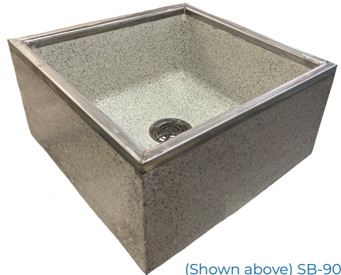
(Shown above) SB-900

Tiling flange is across back and on left side on model numbers ending in "L" or across back and on right side on model numbers ending in "R". Tiling flanges are optional, made of stainless steel, and extend 1" above the shoulder on 1, 2, or 3 sides, as required.