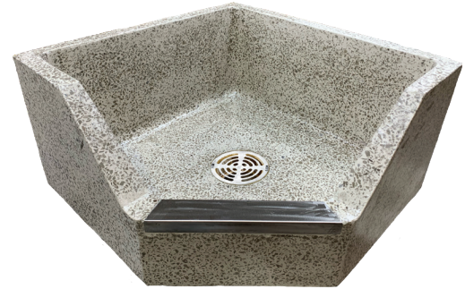
(Shown above) SBC-1700

These units were developed when the need arose to more efficiently drain power-driven floor maintenance equipment. This efficient drop front styling allows the janitor to automatically dump waste water and reduces lifting of conventional cleaning equipment.