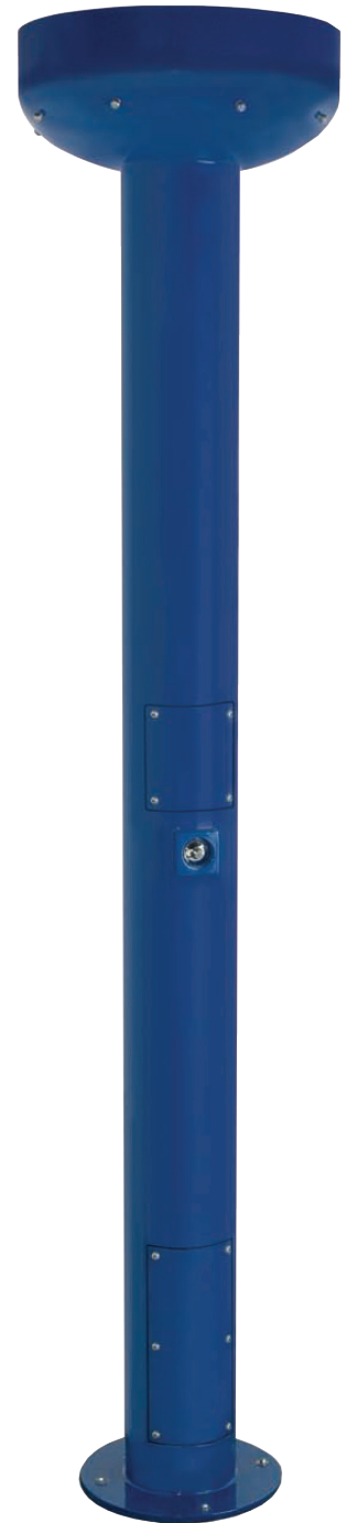
(Shown above) Model 6450