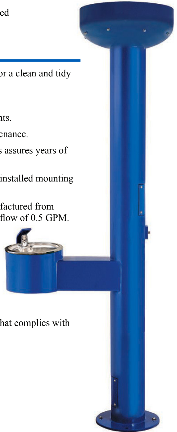
(Shown above) Model 6475