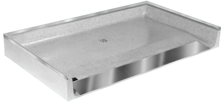
(Shown above) Model WDA-3610

The intent is to allow a wheelchair patient to lift one's self onto a transfer seat with the assistance of a grab bar. This shower floor comes with an integral cast 12" ramp with a 6" stainless steel entry cap.