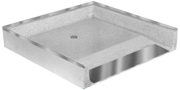
(Shown above) Model WDA-3605

The intent is to allow a wheelchair patient to lift one's self onto a transfer seat with the assistance of a grab bar. This shower floor comes with an integral cast 12" ramp with a 6" stainless steel entry cap. A floor drain by others at the entrance to the sloped threshold and a collapsible water dam (Option: -RDM) are recommended for added protection.